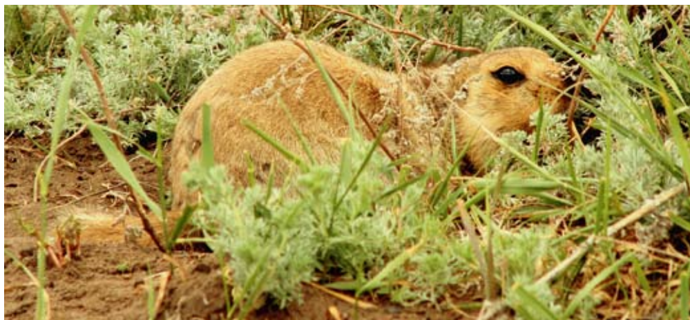
Fig. 1. Adult yellow ground squirrel ( Spermophilus fulvus ) from the Saratov region, Russia; photo by O. BATOVA.

In our studied species, the yellow ground squirrel (Fig. 1), females maintain matrilineal kin groups (POPOV 2007). This species is a relatively long-living (up to 7 years, A. V. TCHABOVSKY, pers. comm.), diurnal, herbivorous, obligatory hibernating sciurid (ISMAGILOV 1969, EFIMOV 2005). It is the largest of the Spermophilus species, with body length without tail of 230–370 mm, body mass at emergence from hibernation of 600–900 g, and body mass before hibernation of 1600–2000 g (ISMAGILOV 1969, EFIMOV 2005, MATROSOVA et al. 2007). Female yearlings are capable of breeding after their first hibernation; while males only after their second hibernation (EFIMOV 2005, POPOV et al. 2006). Mothers maintain prolonged affiliative social contacts with their offspring up to their dispersal or hibernation (STUKOLOVA et al. 2006, STUKOLOVA & TCHABOVSKY 2007). Many of the female yellow ground squirrels hold the same territories for years (SHILOVA