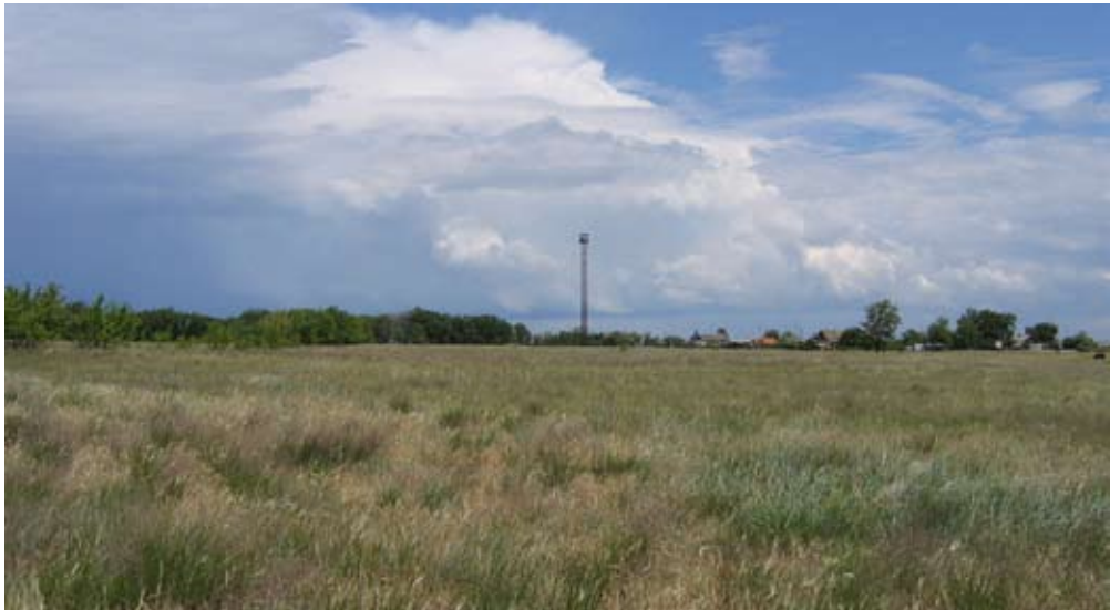
Fig. 2. Hemipsammophile steppe, the habitat of the yellow ground squirrel situated near Djakovka (Saratov region, Russia), in early June. The lookout is visible in the background; photo by E. VOLODINA.

Obr. 2. Stepní trávníky na pisku, biotop sysla žlutého poblíž obce Djakovka (Saratovská oblast, Rusko) na začátku června. Uprostřed je vidět pozorovatelná. Foto E. VOLODINA.