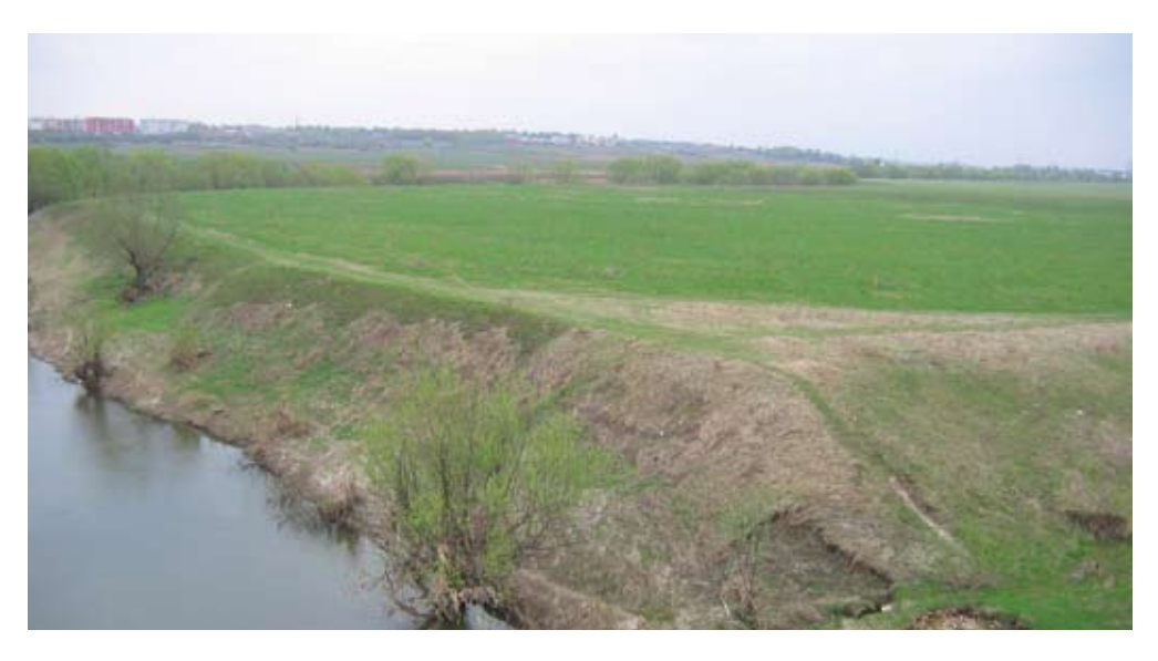
Fig. 2. Habitat of the speckled ground squirrel on the lower bank of the Osetr river (Moscow region, Russia) in early May.

As a measure of population density we used a total number of adult (overwintered) individuals, captured within a study year in the experimental study grid, and the distance to the nearest neighbor (i.e. the minimum distance between the centers of the individual territories). In total, the distances to the nearest neighbor were calculated for 119 individuals: for 31 males and 21 females in 2003, for 26 males and 18 females in 2004 and for 14 males and 9 females in 2005.