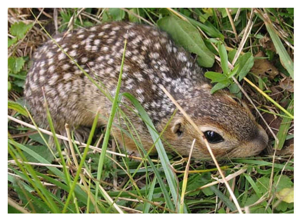
Fig. 1. Adult speckled ground squirrel ( Spermophilus suslicus ) from the south of the Moscow region, Russia.

Nevertheless, direct evidence on the influence of social density on alarm calling is scarce. The available quantitative data are related mostly to the relative vocal activity toward humans or toward natural predators, but not to the acoustic structure of the alarms. They are mostly restricted to the notices that, in some rodents and lagomorphs, alarm vocalization decreases significantly as a result of an abrupt fall in the population density after deratization (see review in SCHILOVA